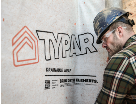
Figure 4. A contractor installs TYPAR® DrainableWrap™ in a residential setting.